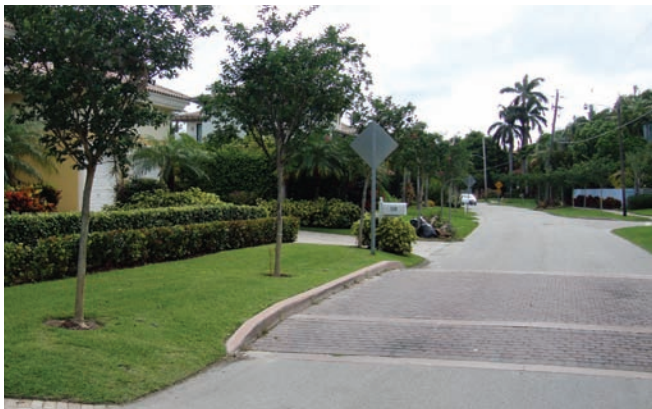
View of Speed Table and Swale