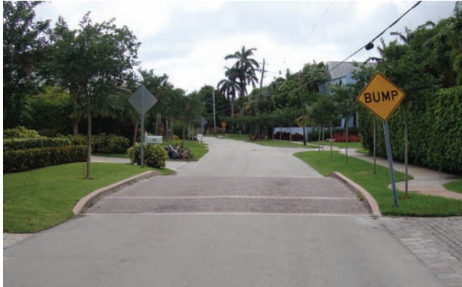
Approaching Key Biscayne Speed Table