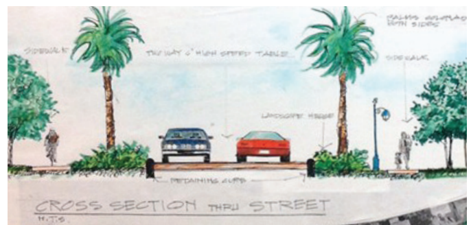
Speed Table Sketches