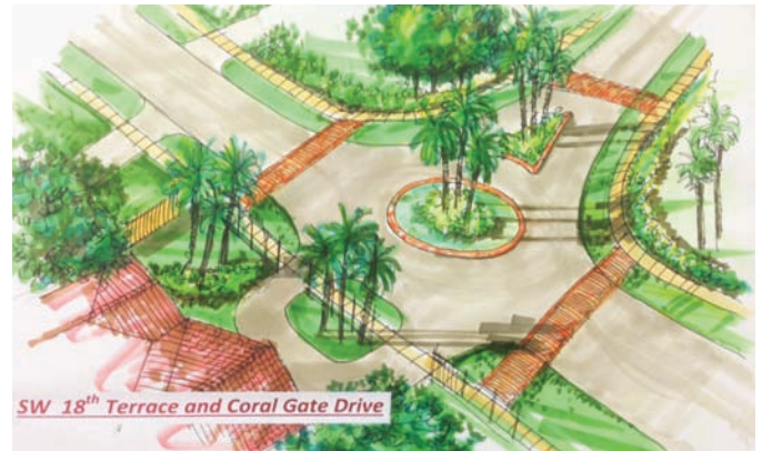
Concept of Circle at SW 18th St and Coral Gate Dr