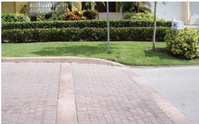
Profile of Speed Table