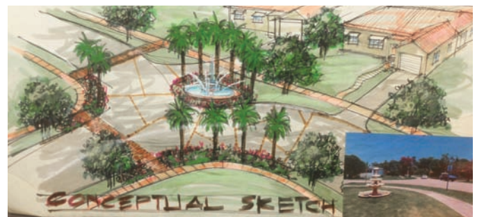
Concept of SW 20th Street Entrance